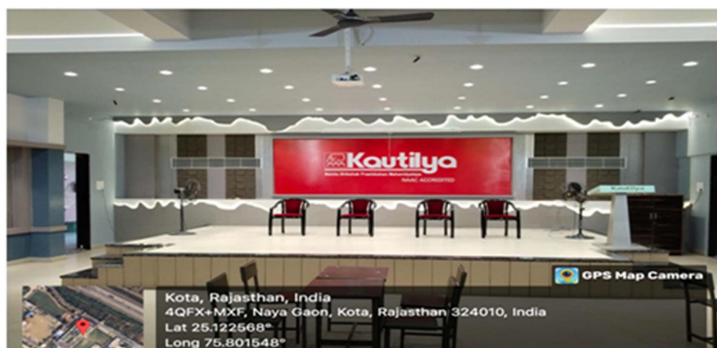
SEMINAR HALL -2 WITH LCD PROJECTOR