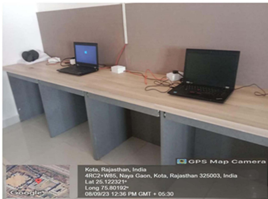
MATHS LAB WITH ICT

Kota, Rajasthan, India 4RC2+W85, Naya Gaon, Kota, Rajasthan 325003, India Lat 25.122321° Long 75.80192° 08/09/23 2:33 PM GMT + 05:30