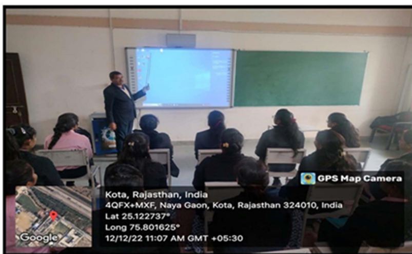
SMART CLASS -ROOM NO 27